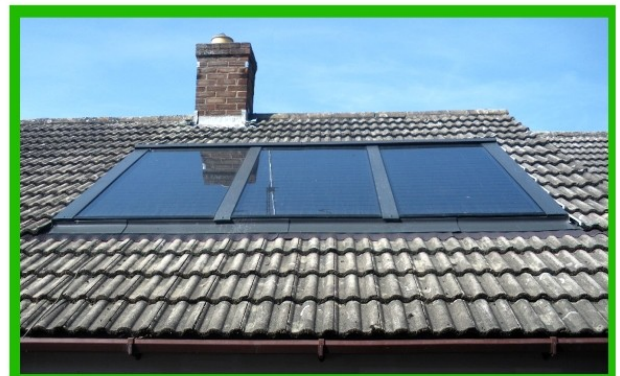
Solar Thermal Panels