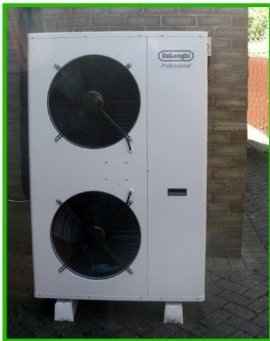
Air Source Heat Pump

"I chose Solarwall as it is a local company which had been in business for over 30 years. Everyone I dealt with appeared to be helpful and knowledgeable.