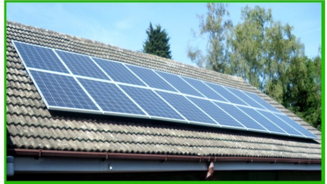
Solar Photovoltaic Panels

An energy conscious customer in Hull not only wanted to generate their own electricity and benefit from the Feed in Tariff, but also wanted to heat their water and home. Solarwall immediately set to installing Solar Photovoltaic panels for electricity, a Solar Thermal System for water heating and an Air Source Heat Pump to help make their house cosier.